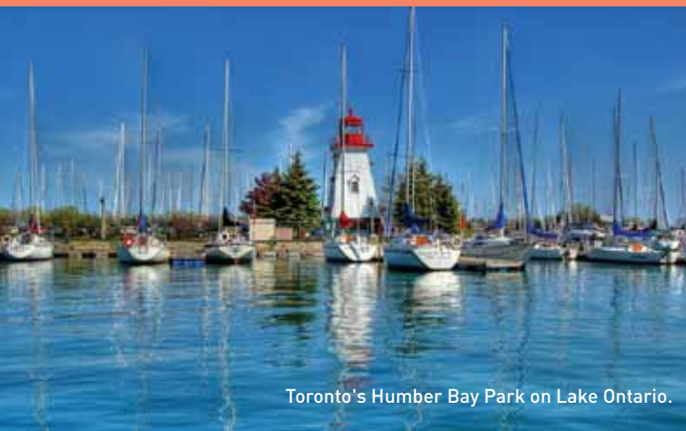
Toronto's Humber Bay Park on Lake Ontario.