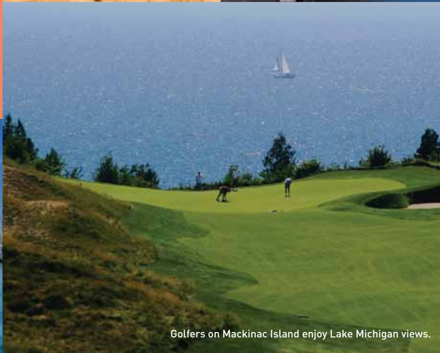
Golfers on Mackinac Island enjoy Lake Michigan views.