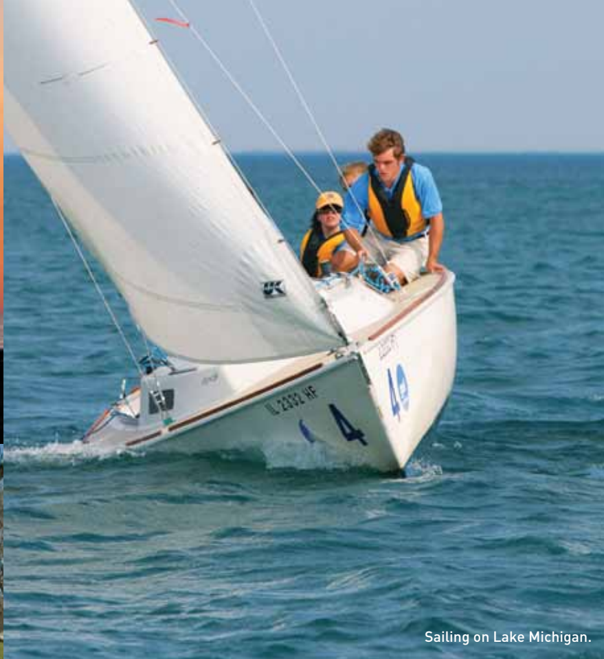
Sailing on Lake Michigan.