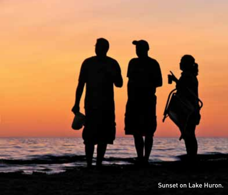
Sunset on Lake Huron.