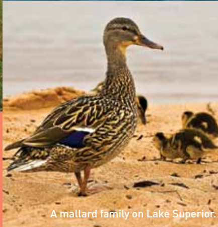
A mallard family on Lake Superior.