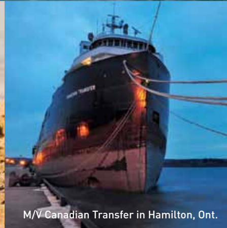
M/V Canadian Transfer in Hamilton, Ont.