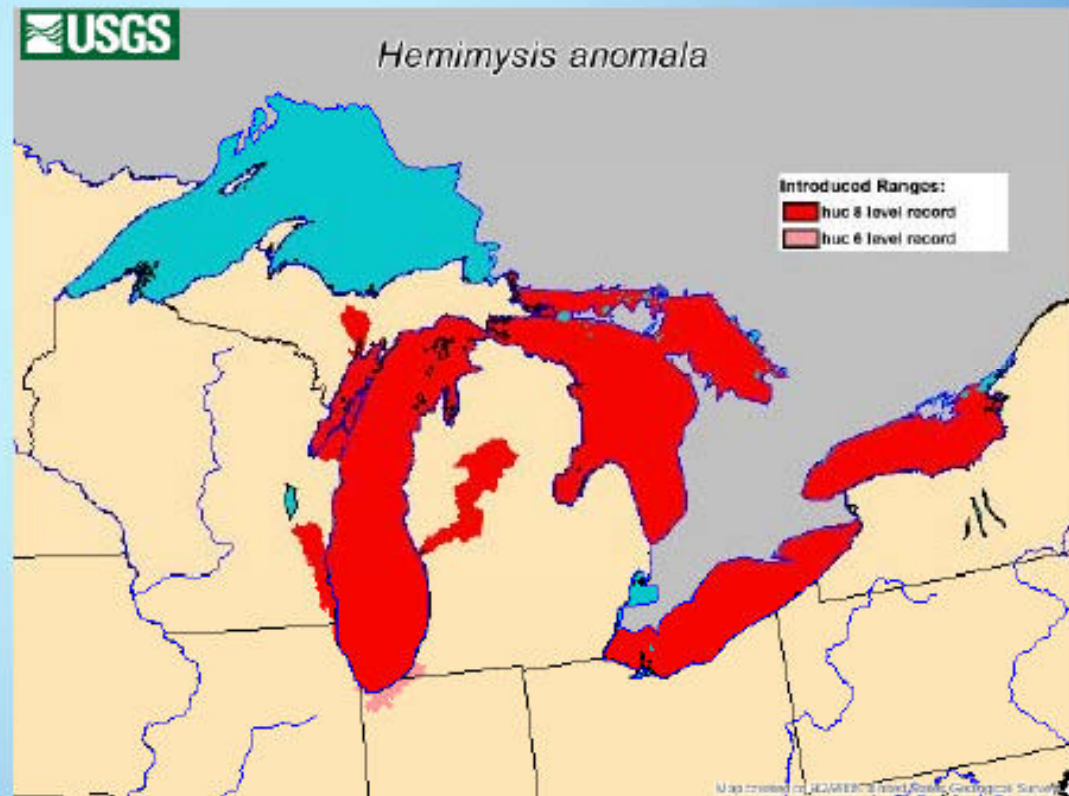
Photo and map courtesy of Great Lakes Aquatic Nonindigenous Species Information System