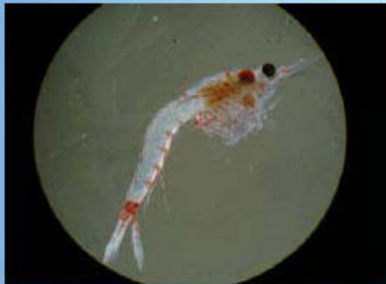
Bloody Red Shrimp Hemimysis anomala

>125 AIS in all Great Lakes, about 1/3 found in Lake Superior