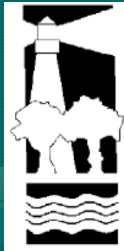
Cuyahoga River RAP