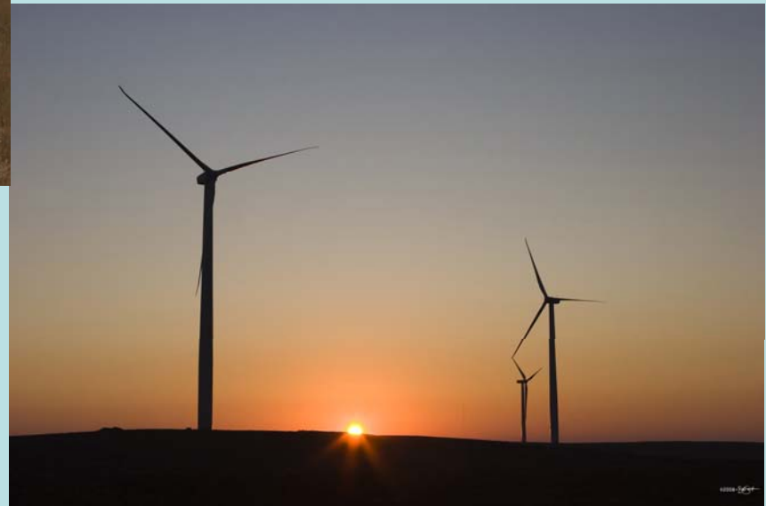
Michigan Wind I 69 MW