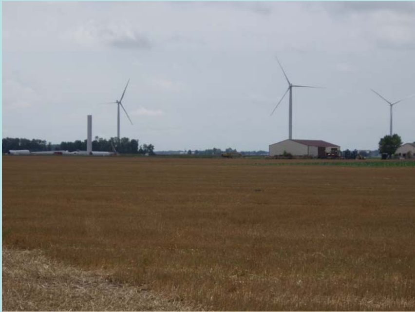
Harvest Wind Farm 53 MW