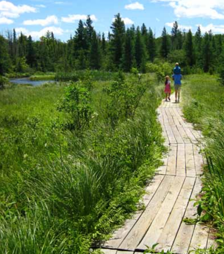
A boardwalk along the wetlands of the Grass River Natural Area in Bellaire, Michigan.