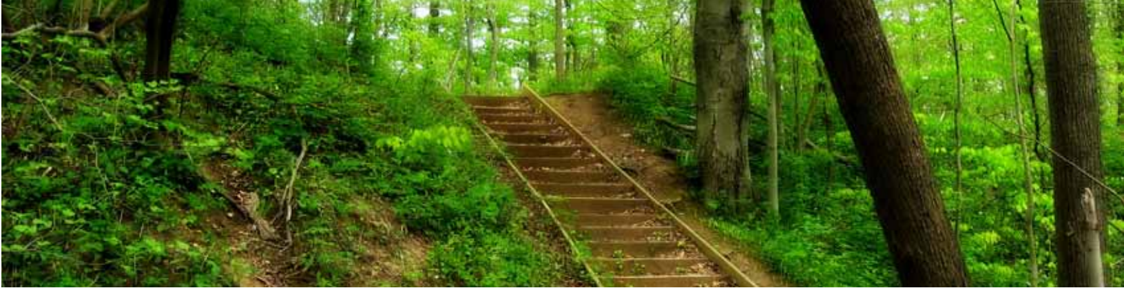
Grant Park, located on the coast of the city of South Milwaukee, Wisconsin, along Lake Michigan.