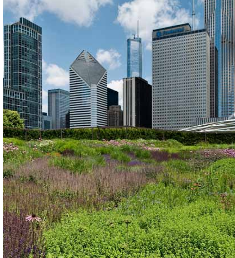
Lurie Gardens, part of downtown Chicago's Millennium Park.

Local governments often work together with community groups to acquire, maintain and enhance greenspaces for public use and habitat protection. The 15,000 acres (6,070 hectares) of greenspace acquired and protected in northeastern Illinois is an example of the incredible work being accomplished in the region. In Ontario, Canada, the 1.8 million acre Greenbelt (728,400 hectares) helps protect wetlands, farms and forests around the Niagara, Hamilton and Toronto area. The Greenbelt is estimated to provide $2.6 billion dollars a year in ecological services such as flood protection, water filtration, recreation and carbon storage.