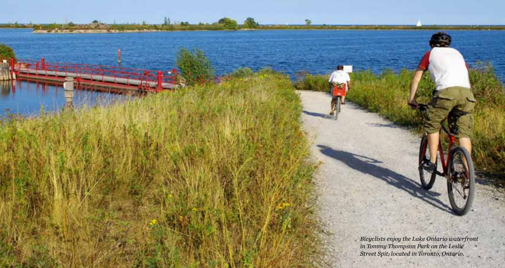
Bicyclists enjoy the Lake Ontario waterfront in Tommy Thompson Park on the Leslie Street Spit, located in Toronto, Ontario.