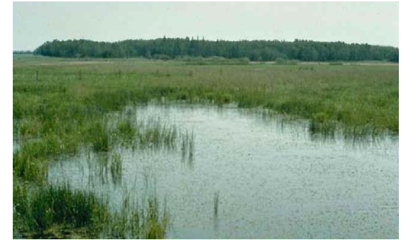
Habitat and species