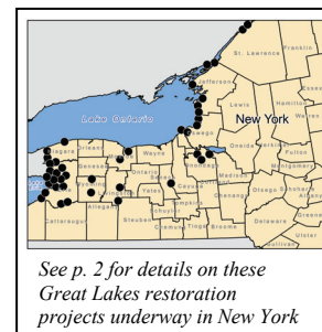
See p. 2 for details on these Great Lakes restoration projects underway in New York

The State of New York – together with local communities, tribes, business and industry, and nongovernmental organizations – is collaborating with the federal government to implement a comprehensive restoration strategy for the Great Lakes. This partnership is generating on-the-ground actions that will improve New York’s economy, environment and quality of life. This fact sheet describes how Great Lakes restoration is benefiting New York and showcases restoration projects now underway.