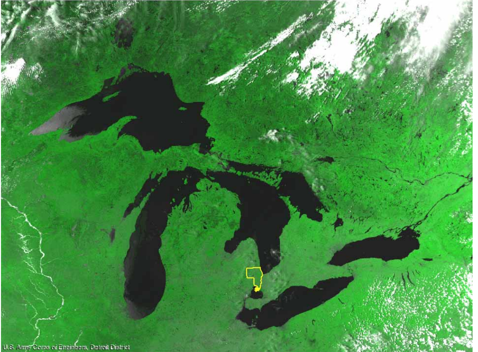
U.S. Army Corps of Engineers, Detroit District