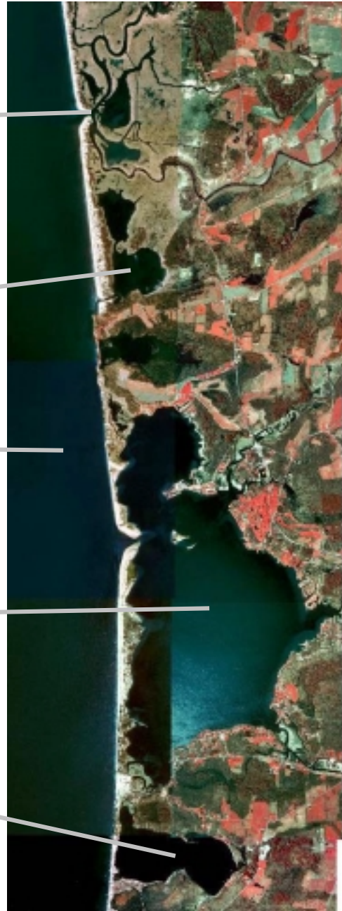
Figure 2. Eastern set of biocomplexity study sites along the eastern shore of Lake Ontario.

Drainage area 8.26 km 2 Surface area 1.23 km 2 Protected Embayment