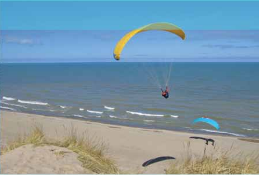
Paragliding over Lake Michigan and Indiana Dunes National Lakeshore near Dune Acres, Ind.