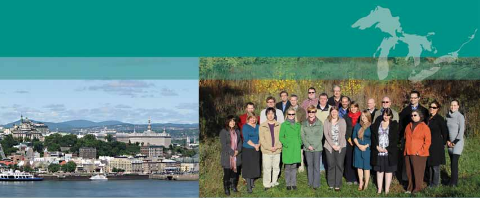
Great Lakes Commission staff in Ann Arbor, Mich.