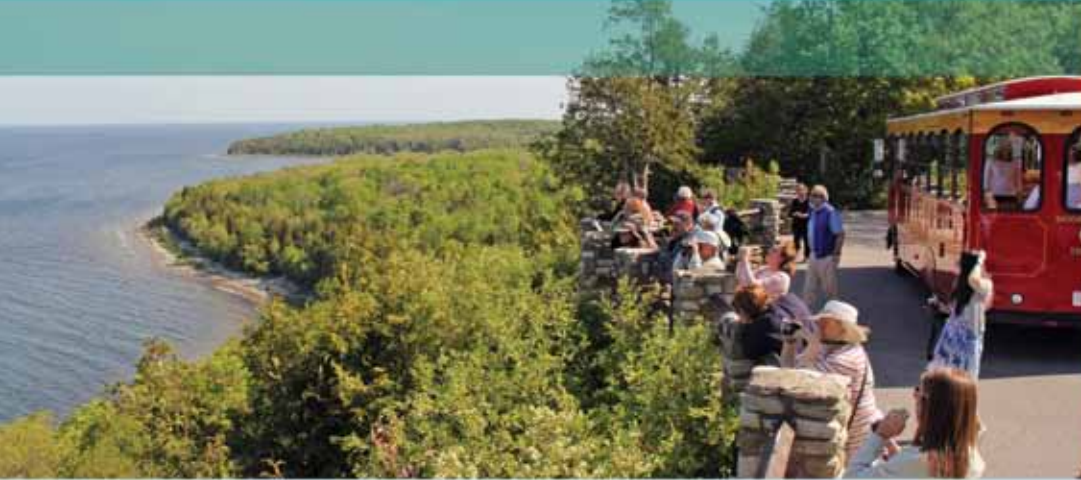
Lake Michigan in Door County, Wis.