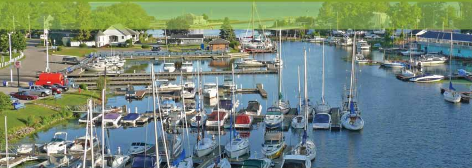
The Town of Newfane Marina on Lake Ontario in Olcott, N.Y. | Cover image: Lake Superior, Pictured Rocks National Lakeshore in Alger County, Mich.