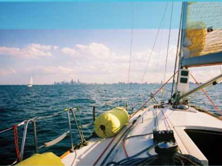
Sailing on Lake Michigan near Chicago, Ill.