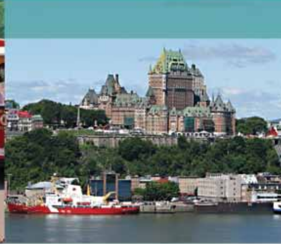
The St. Lawrence River in Québec City, Québec.