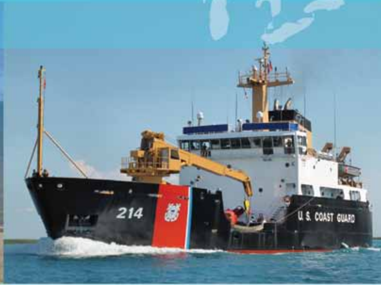
U.S. Coast Guard Cutter Hollyhock on the St. Clair River.

The Great Lakes Commission concluded FY 2012 in sound financial condition, with operating revenues of over $9.4 million. Expenses exceeded revenues by $297,885, or approximately three percent. This was in part due to buyout payments to several employees being recognized in this fiscal year.