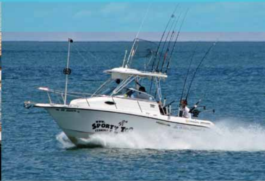
Lake Erie sport fishing in Erieau, Ont.

The great majority of Commission programs and projects are pursued in partnership with other agencies and organizations, and benefit from their funding support. A listing of 2012 funders and supporters is provided below. Thanks to all for their assistance!