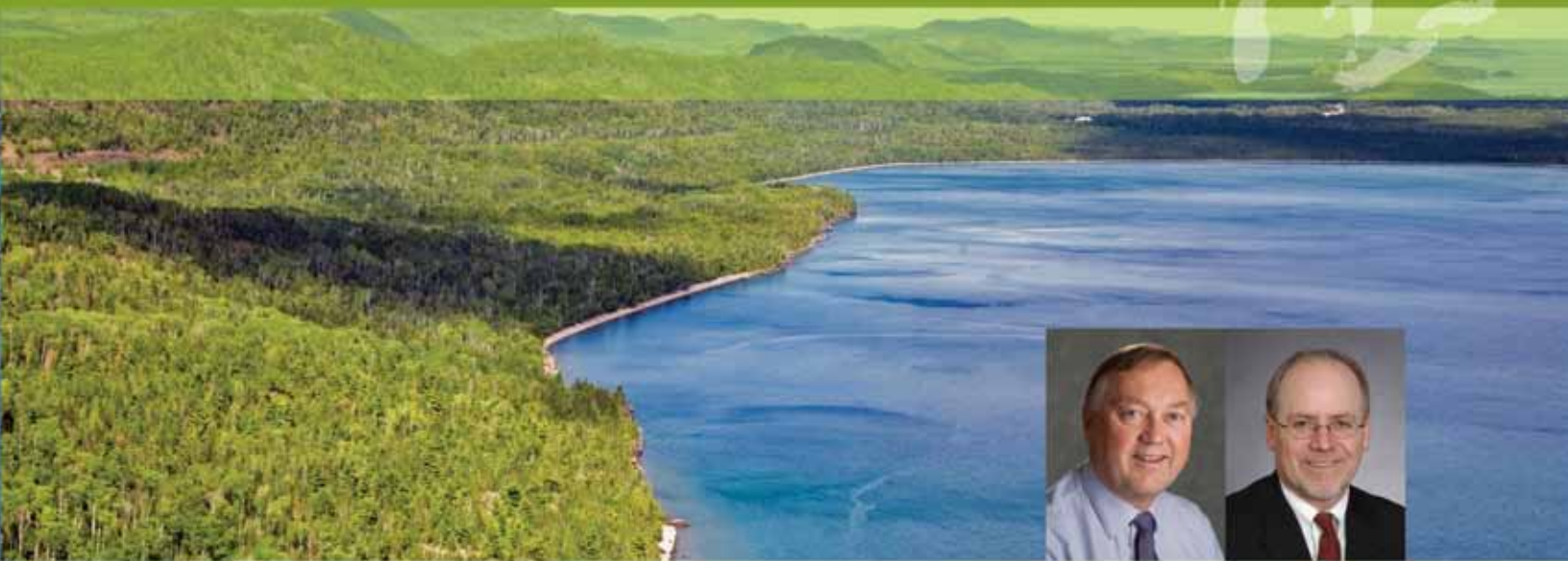
Lake Superior from the top of Mount Josephine in Grand Portage, Minn.