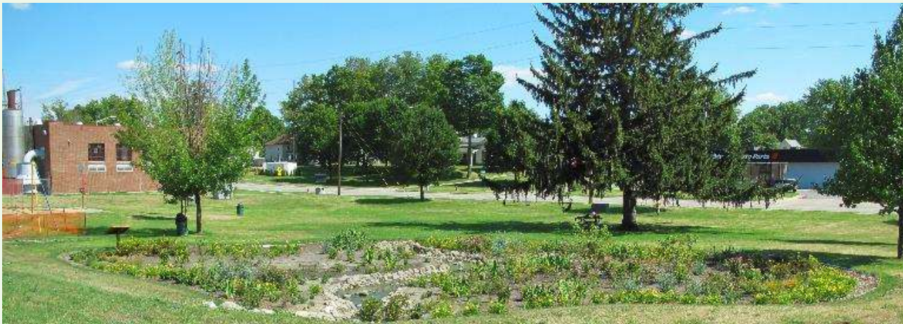
Memorial Park, Sturgis, MI