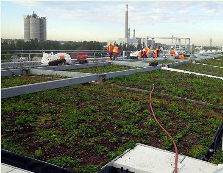
Leslie Barns Streetcar Maintenance and Storage Facility, Toronto, ON