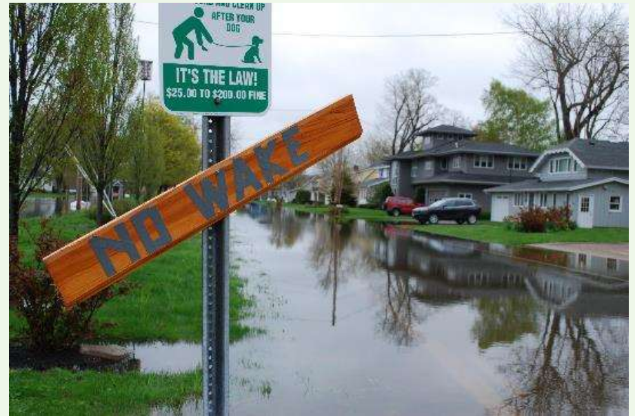
Flooding in Sodus Point, New York