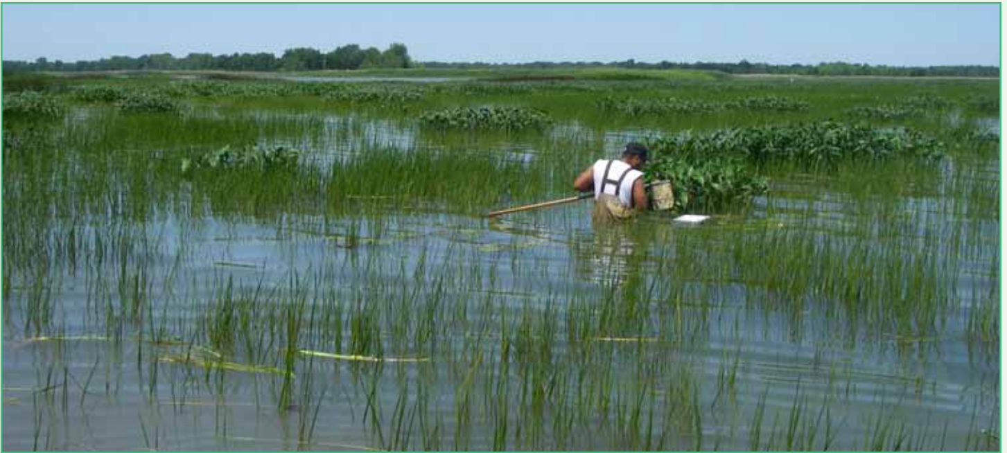
Saginaw Bay, Michigan, United States