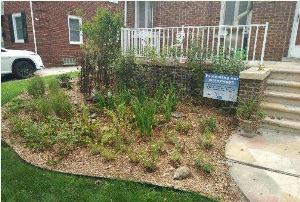
City of Dearborn, MI