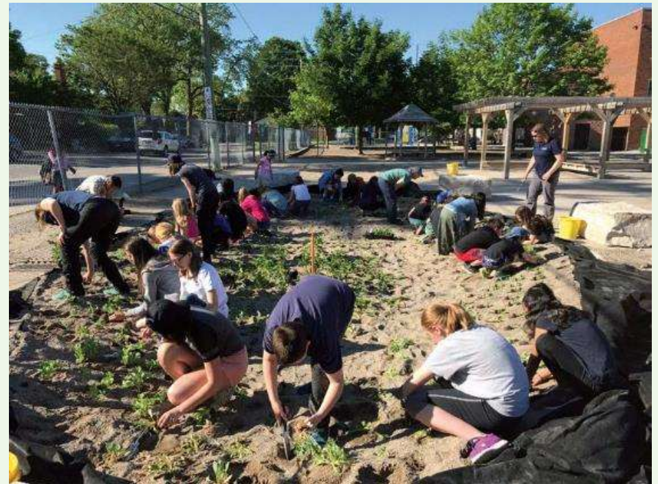
Upper Thames River Conservation Authority