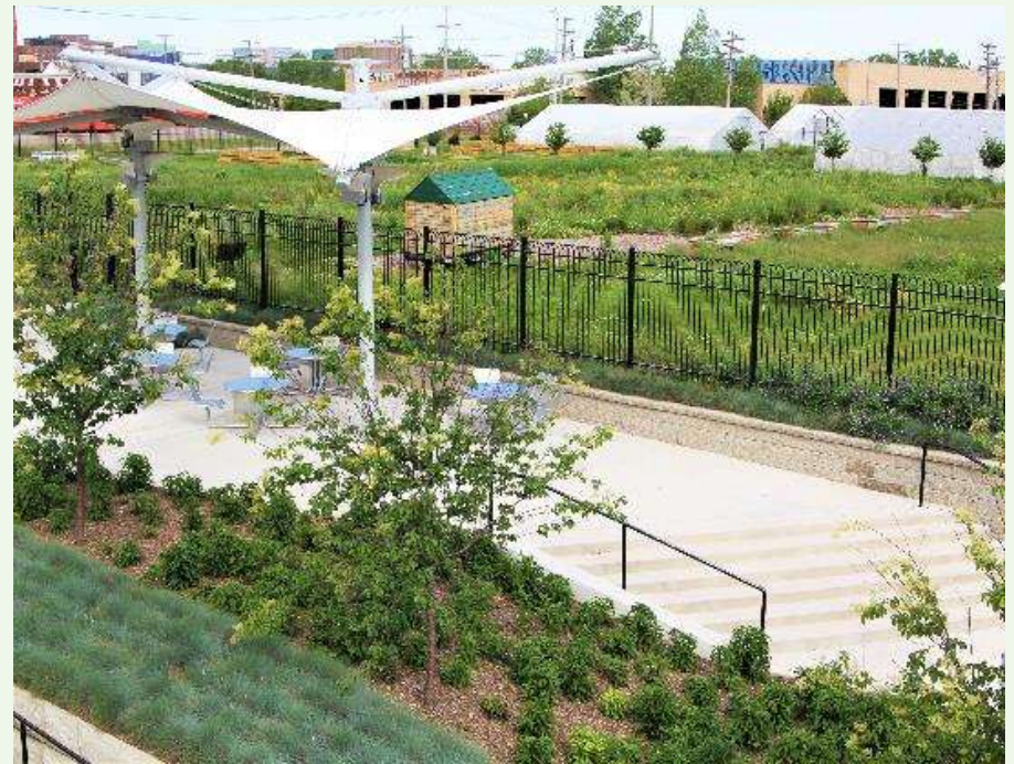
Dequindre Cut, Detroit, MI