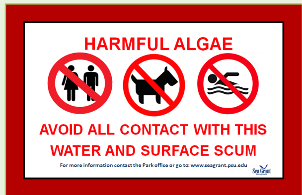
Pennsylvania Lake Erie Harmful Algal Bloom Task Force developed signage on Presque Isle State Park to connect action to test results.

This coordinated approach ensures public safety while delivering clear, consistent messaging to the community.