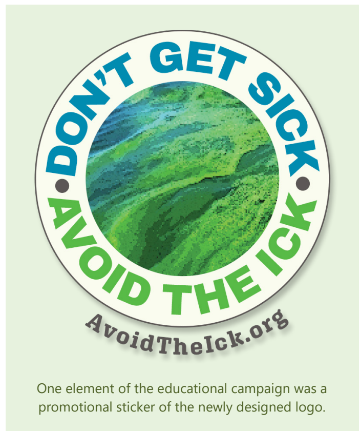
One element of the educational campaign was a promotional sticker of the newly designed logo.

NEW Water enlisted help from Brown County Public Health, and the O'Connor Connective, a local strategy and marketing communications consultancy, to develop materials to enhance awareness of this public