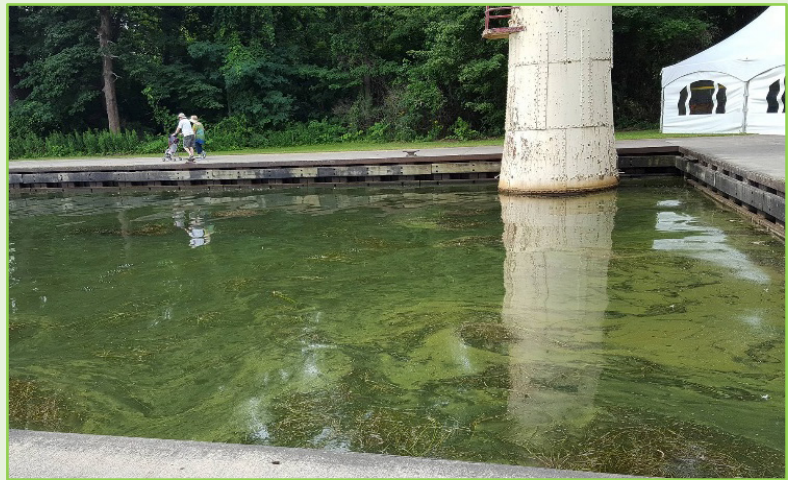
Harmful Algal Bloom at Presque Isle State Park.

With 11 public beaches and millions of visitors annually, Presque Isle State Park is one of Pennsylvania's most popular recreation areas. Unfortunately, it is also vulnerable to HAB impacts. Although Lake Erie is a primary focus, HABs have also been confirmed in inland lakes across the commonwealth, highlighting the need for broader awareness. The PA DEP also leads a statewide HAB Task Force focusing on outreach and research.