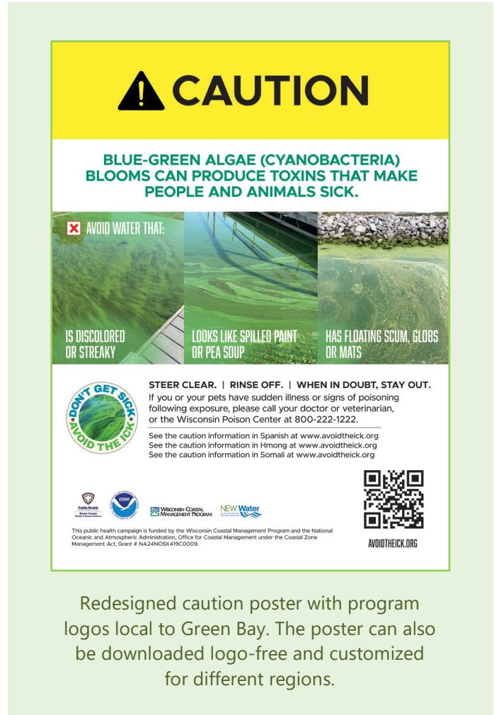
Redesigned caution poster with program logos local to Green Bay. The poster can also be downloaded logo-free and customized for different regions.

The educational campaign is focused on providing the public with information about how to keep themselves and their pets safe from HABs, while still emphasizing the outstanding freshwater resource that is Green Bay.