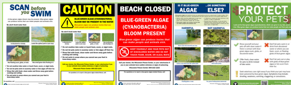
Examples of HABs signage developed by Wisconsin DHS. There are signs about how to scan the water for cyanoHABs before you swim, cautions, closed beaches, protecting pets, and more. Local public health, Indigenous Nation, and select Department of Natural Resources authorities may purchase them.