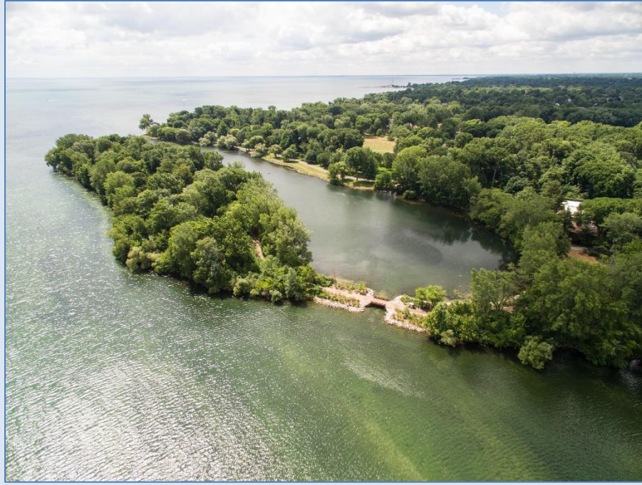
Aerial view of Ford Cove