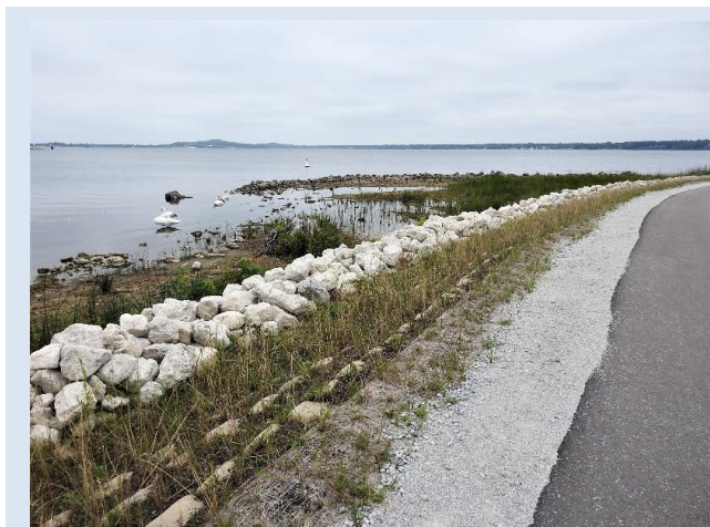
Project site

Within the lower Muskegon River watershed lies the Muskegon Lake AOC , a drowned river mouth lake that flows into Lake Michigan at a shoreline that is part of the world's largest assemblage of freshwater sand dunes. Muskegon Lake was designated an AOC in 1985 due to ecological problems caused by industrial discharges, shoreline alterations and the filling of open water and coastal wetlands.