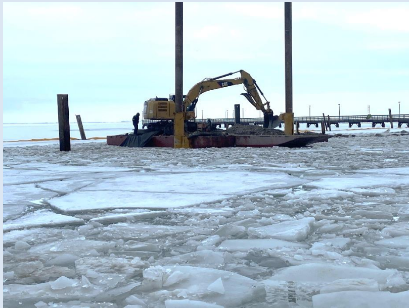
Construction work taking place at Brandenburg Park

Located in Chesterfield Township, MI, Brandenburg Park is situated along the shoreline of Lake St. Clair. Owned and maintained by the Township, the park sees a steady stream of visitors and features four open-air pavilions, a splash pad, and a multipurpose building. Located off Jefferson Avenue a quarter-mile south of 23 Mile Road, this 17-acre parcel is positioned along the shore of Anchor Bay and serves the recreational needs of the township and the greater Lake St. Clair area with a unique assortment of facilities. The park's 500-foot pier is one of only a few in Metro Detroit from which individuals can fish and view wildlife. Located five miles from